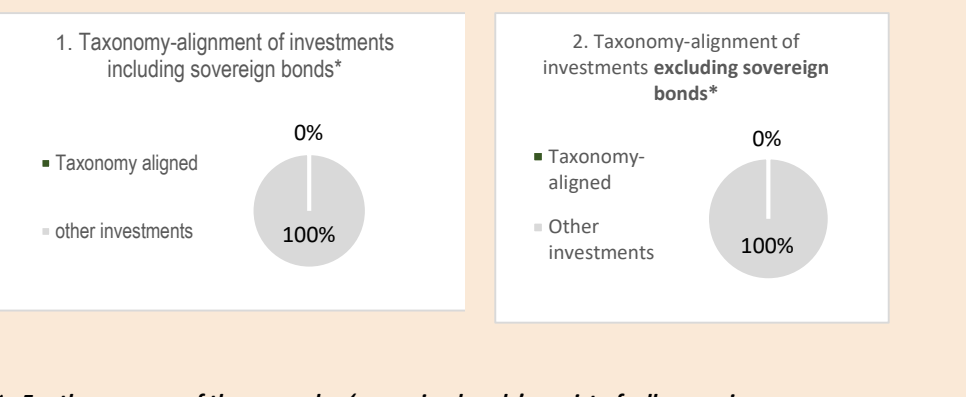
* For the purpose of these graphs, 'sovereign bonds' consist of all sovereign exposures

The two graphs below show in green the minimum percentage of investments that are aligned with the EU Taxonomy. As there is no appropriate methodology to determine the Taxonomy-alignment of sovereign bonds*, the first graph shows the Taxonomy alignment in relation to all the investments of the financial product including sovereign bonds, while the second graph shows the Taxonomy alignment only in relation to the investments of the financial product other than sovereign bonds.